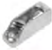
CURRY CLAMP AISI 316 ITEM NO. For rope Weight 002431 3-6 mm 58g